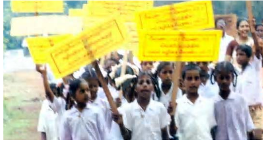
Children as Catalysts of Change Marching to Make a Healthier Village

Teaching children to adopt good hygiene practices ensures a healthy next generation. Children help in continuous reinforcement of behaviour changes like toilet use, waste segregation and keeping environment clean.