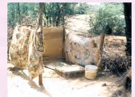
Toilet @ Household