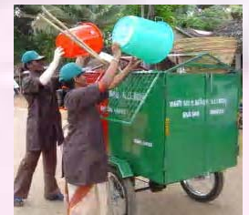
Segregated Garbage – Daily Collection