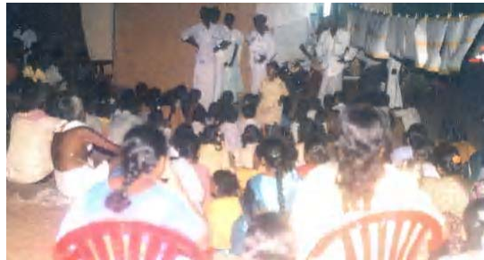
Street Theatre Shows Promoting Adoption of Best Hygiene Practice