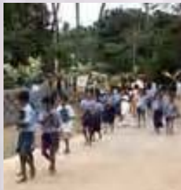
Tree Planting by Children