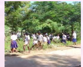
Mass Cleaning by Children